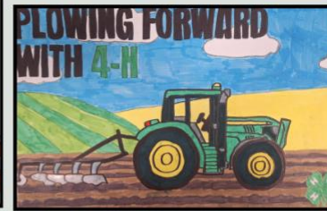
5th grade winner: Boone Hampton